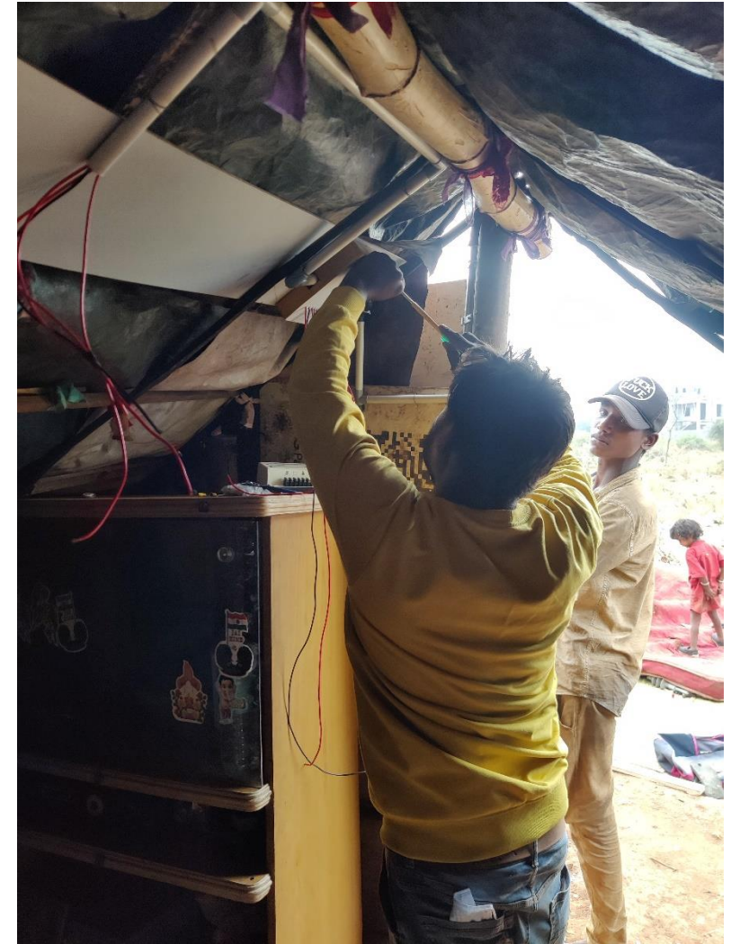
Solar panels being installed in the Kadabagere community