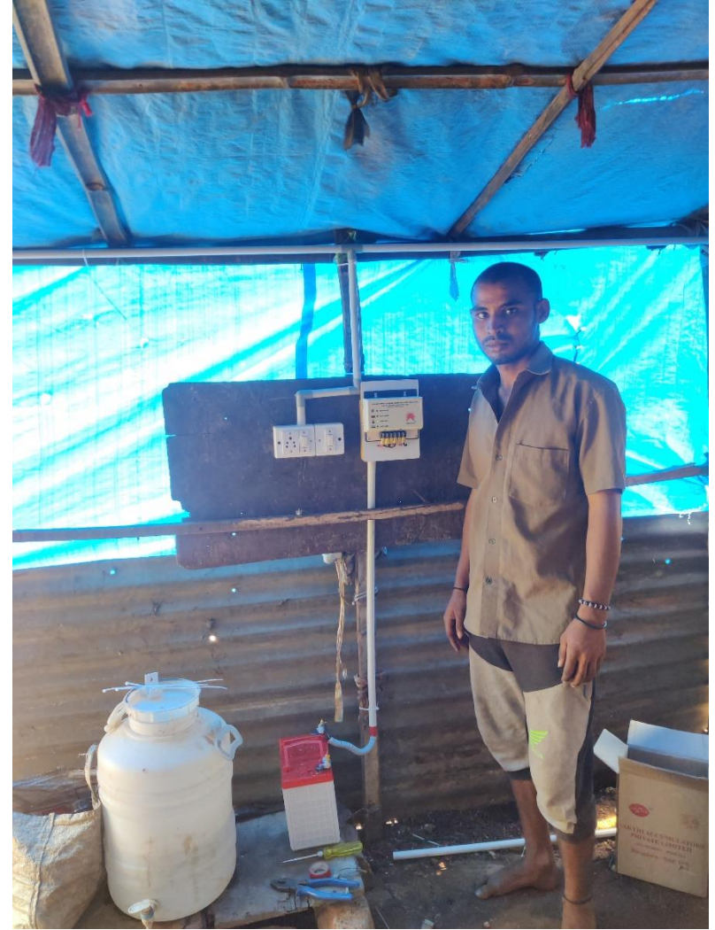
The residents of the community with the solar lights in their habitats