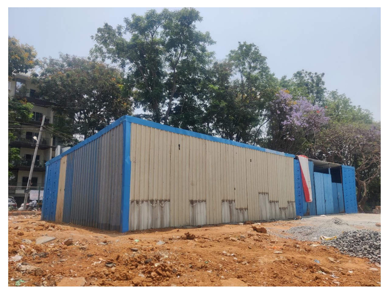
Structure of the Dry Waste Collection Centre