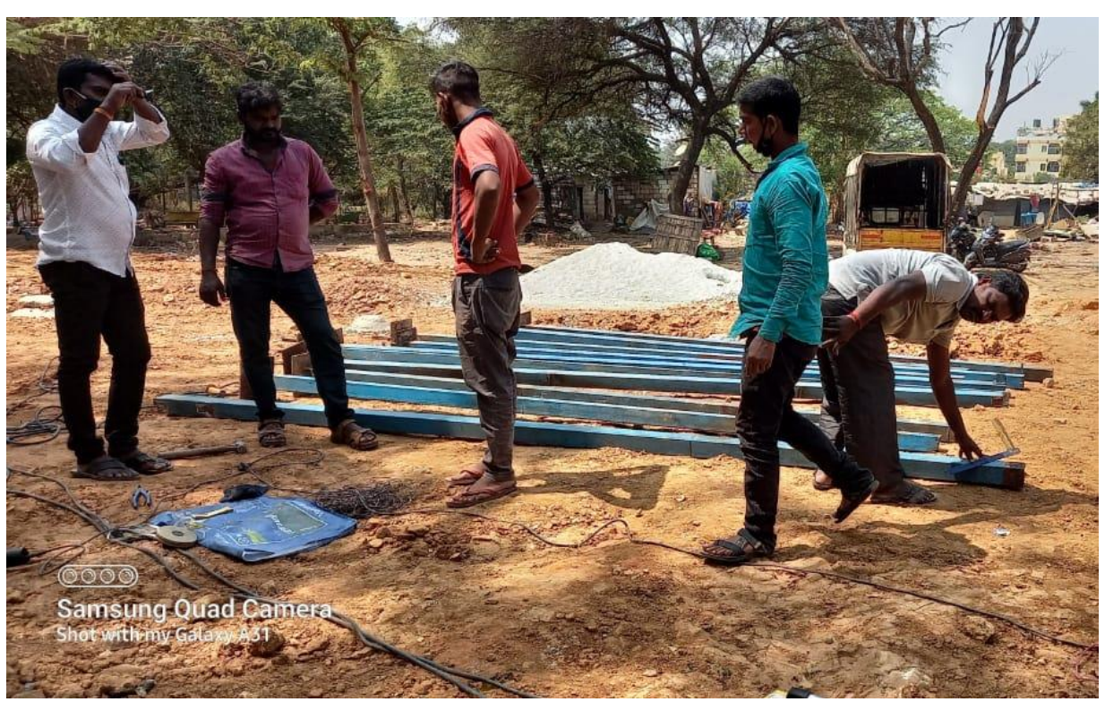
Fabrication work in progress