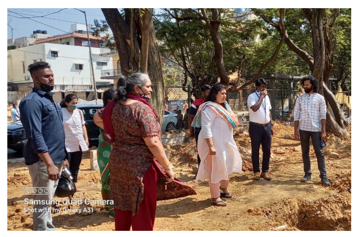
Sowmya Reddy, the local MLA visiting the construction site