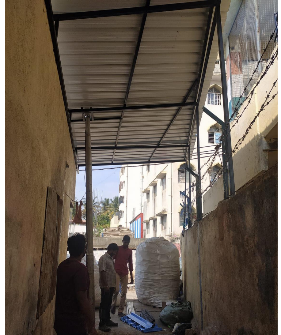
The pictures of completed extension work